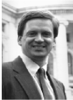
Mark Green, author of Wisconsin's Klaas Agenda

W e've all heard the sad stories. They're on television, in the paper, and—for the most unfortunate of us—written on the faces of our family members or friends. Tragically, every community in America has its own Polly Klaas, and too many have more than one.